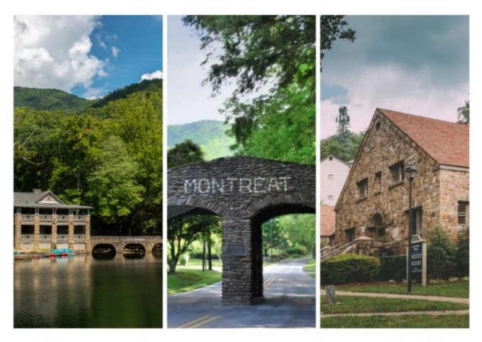
Youth Conference July 9-16